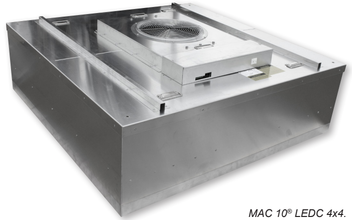
MAC 10 ® LEDC 4x4.